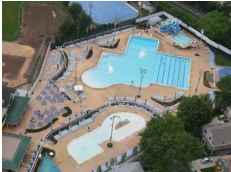
View of Floral Park Recreational Center, with Main Line in background.