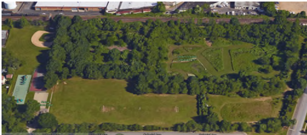
Aerial view of Garden City Bird Sanctuary and New Haven Park.

Floral Park is particularly concerned about vibration impacts in the vicinity of its Recreation Center. The Center includes a pool complex that is directly adjacent to the Main Line and was fully re-constructed in 2015 at great expense to the community. Before undertaking that project, the Village checked the MTA Capital Plan and other materials to confirm that no significant work was being proposed in that area. Now, this Project is proceeding outside the MTA Capital Plan process. The Project will involve a significant increase in track elevation and installation of retaining walls next to the Center. This issue was raised in the Village of Floral Park's comments to the Scoping Document, yet, the DEIS all but ignores it.