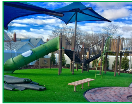
Newly renovated Tiny Town as a work in progress.