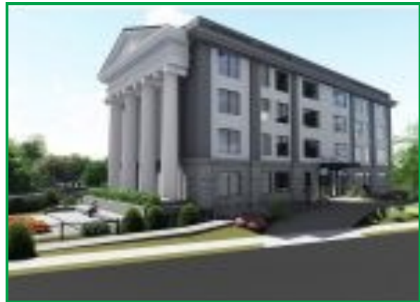
One of The Friedman Group's proposed renderings for Centennial Hall. For additional renderings, please see the online version of the Village Items at www.fpvillage.org .

The contract also required that the property be renovated in a manner substantially similar to the architectural renderings submitted by The Friedman Group at the April 2018 Public Visioning Session, and that the plans be approved by the Village's Architectural Review Board and the Village's Zoning Board of Appeals.