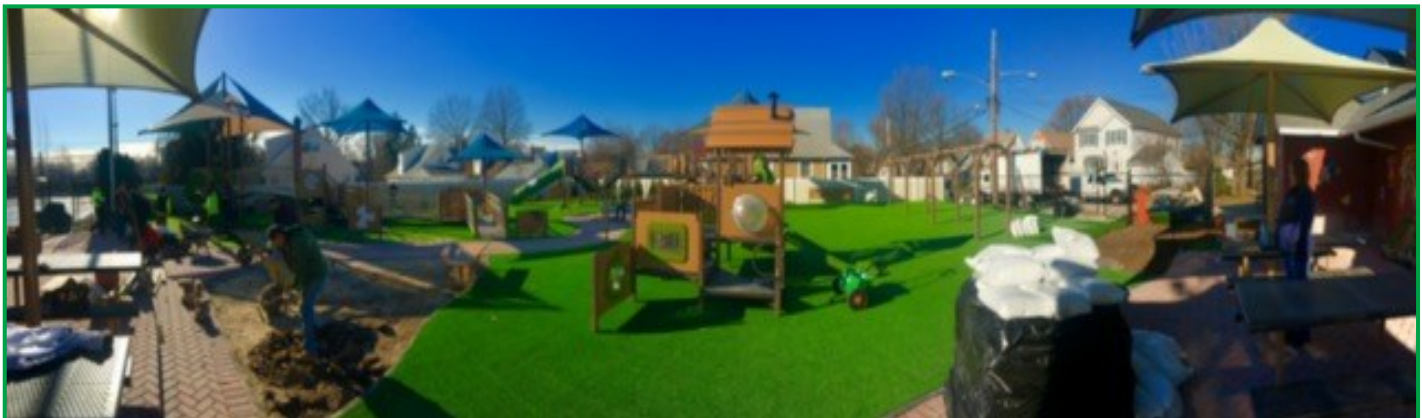
Tiny Town renovations are almost completed. Grand opening expected early next year.

The Department of Recreation is busy making plans for the Summer of 2019. Join us again this summer for all our programs that make Floral Park a great place to live and grow up.