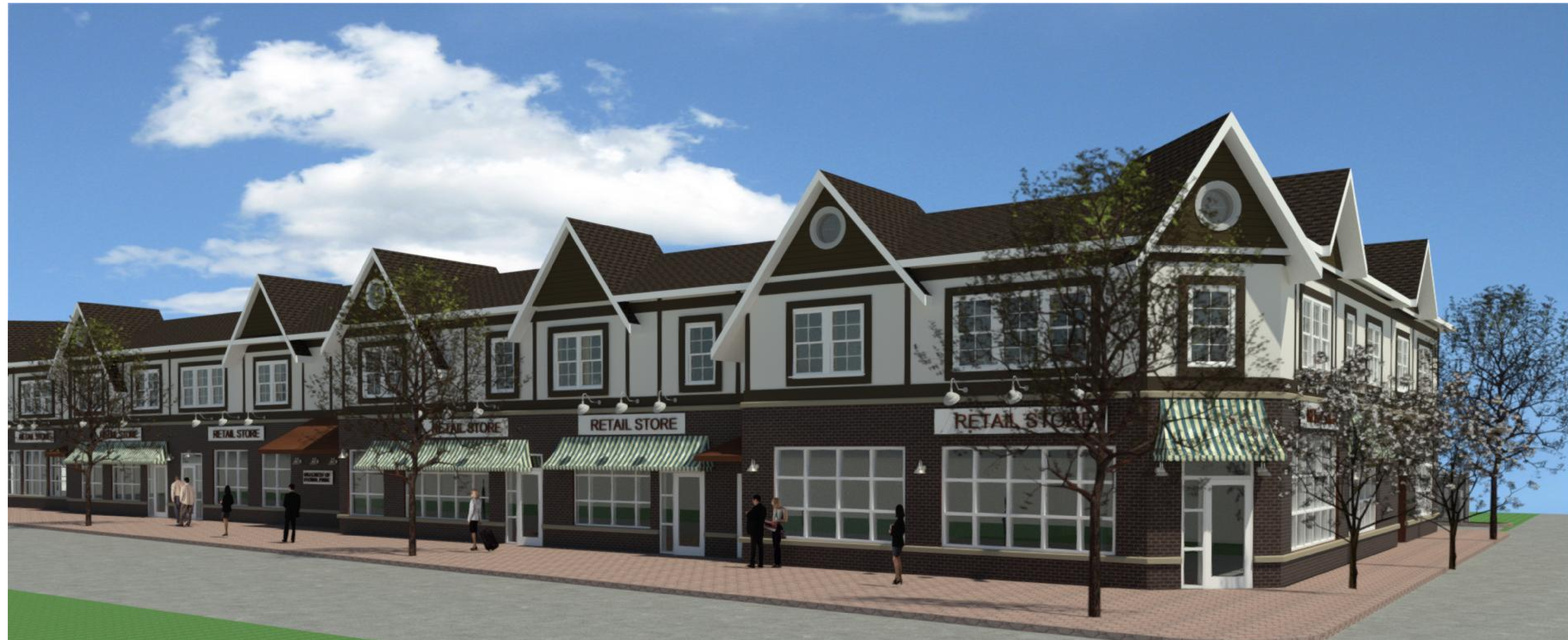
PROPOSED RENDERING FROM COVERT AVENUE